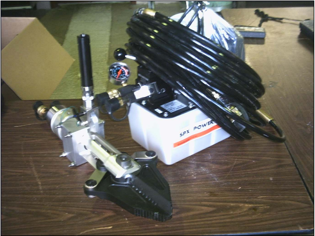
Hydraulic Cutter with Jaws - Part# D0096G04

For heavy duty needs, EPI offers as an option, the “Jaws of Life” type cutter head. Also designed for underwater applications, this cutter is perfect for sectioning LPRMs. With a cutting force of 67,000 lbs., this tool easily cuts through conduit, bolts, sheet metal, pipe and more.