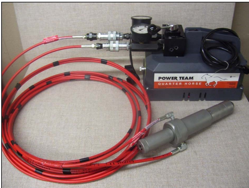
(Adjustable 3 inch Expansion Tool with Electric Pump)