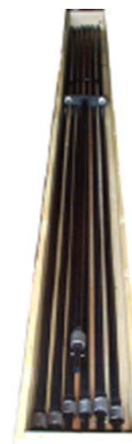
Additional Handling Poles