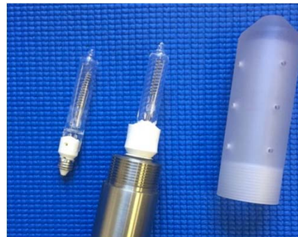
Standard Bulb vs. GFI-ready Bulb

The seal surrounds the base of the bulb and keeps water from entering the bulb socket. This allows the light assembly to work in conjunction with a ground fault circuit interrupter (GFI). The GFI-ready light assembly has been used in the nuclear industry for several years already and has proven to work well for customers who are required to use the ground fault circuit protectors